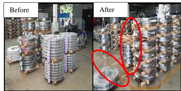
Fig 1 Examples of 5S for improving the workplace

place by separating them according to the customer company's alphabet.