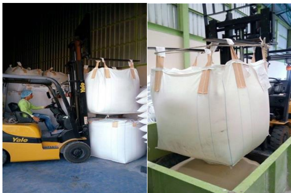
Fig 3 Examples of Waste eliminated for work improvement

transportations during the washing and rice milling processes throughout the preparation stage.