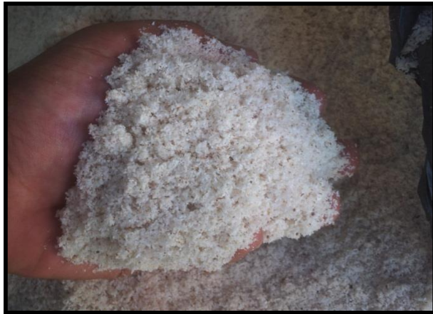
Fig. 1 Coconut Meat Husk

the Fibre and Biocomposite Development Centre (FIDEC), Olak Lempit, Banting.